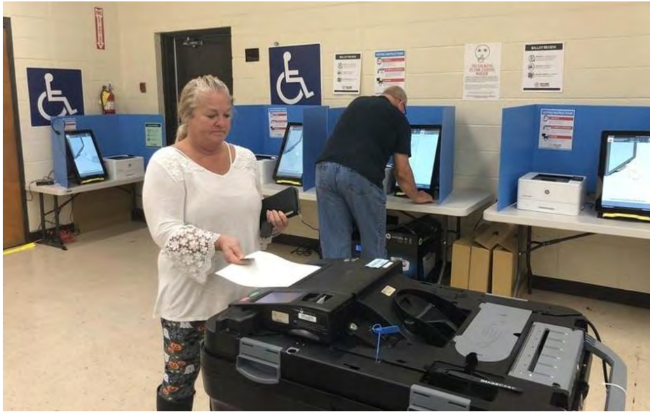
Figure 5. Cartersville, Georgia Polling Place

435. Figure 6 is a true and correct photograph of the inside of the State Farm Arena polling place in Fulton County, Georgia, taken in October 2020, during early voting for the General Election.