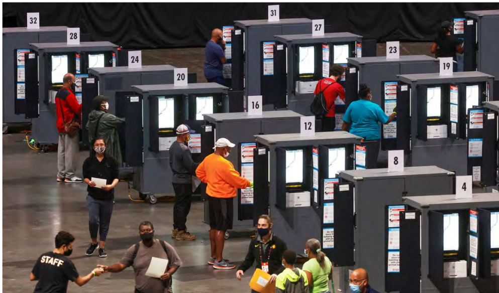
People cast their ballots during early voting for the presidential elections at State Farm Arena in Atlanta, Ga., October 12, 2020.

435. Figure 6 is a true and correct photograph of the inside of the State Farm Arena polling place in Fulton County, Georgia, taken in October 2020, during early voting for the General Election.